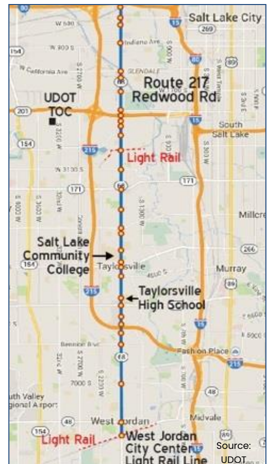
Map of the UDOT pilot on Redwood avenue. The dots represent installed RSUs.