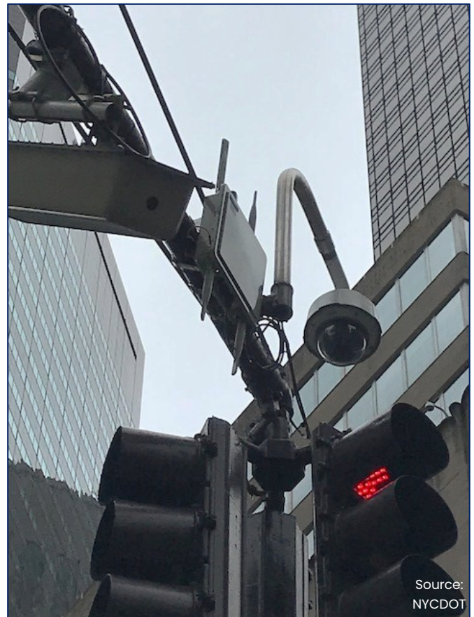
An RSU mounted on a traffic signal at an intersection in New York City.