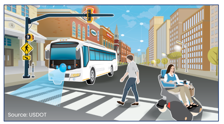
Depiction of SPaT technology concept.

Reduce Fuel Consumption. SPaT data can support limiting fuel consumption through eco-routing features and Eco-Approach and Departure (EAD) applications. DSRC technology can send SPaT-based notices to drivers about vehicle speed. These messages can limit fuel consumption during deceleration and acceleration and reduce idling and stopping (2019-01355).