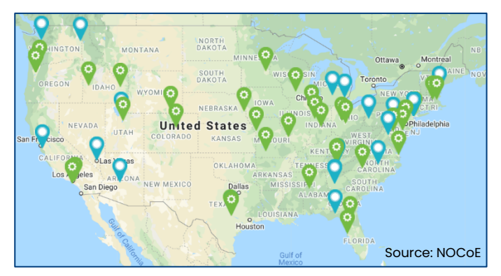
Blue pins indicate operational SPaT deployments, while green pins indicate SPaT deployments that are underway.

Develop Safety Features. Safety application developers can create new opportunities to improve vehicle safety at intersections using