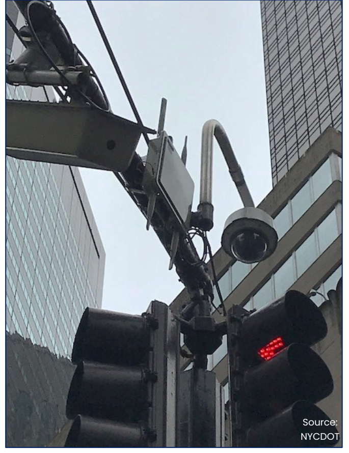
An RSU mounted on a traffic signal at an intersection in New York City.

evolution of communications technology. A NOCoE published report notes that considering the future compatibility of RSU technology is an important consideration, specifically when deciding between RSU units with DSRC or centrally controlled cellular/WIFI capability. NOCoE recommends installing units that have dual capabilities for each, allowing for flexibility in the adoption of specific kinds of RSUs (2019-00900).