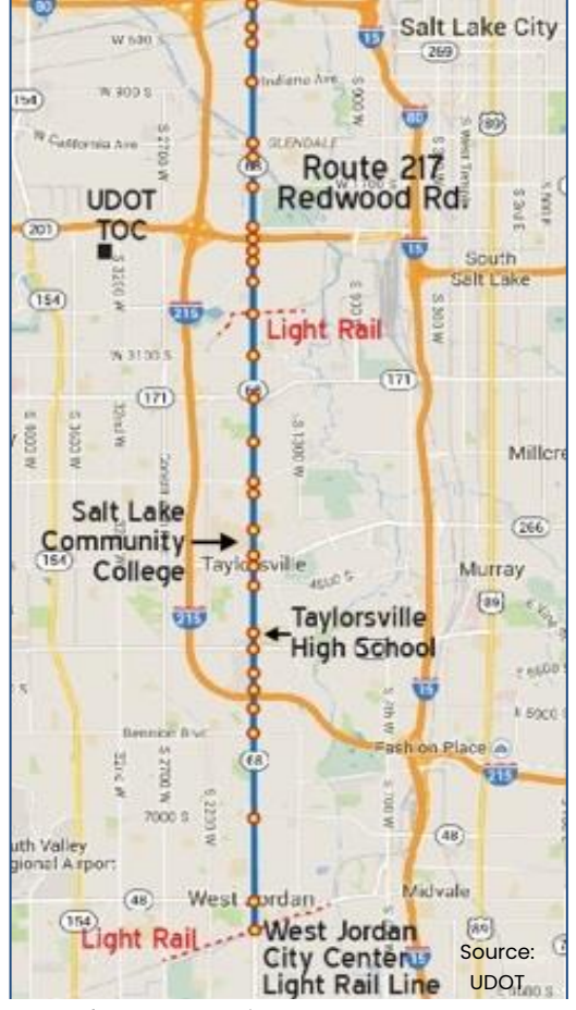
Map of the UDOT pilot on Redwood avenue. The dots represent installed RSUs.