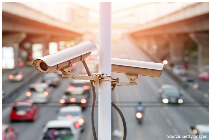
Cameras tracking vehicles movement on highway

Using a TMC as the information hub, Florida's Turnpike Enterprise deployed safety benefits through a ramp-based wrong-way driving detection and deterrent system (2017-01148) . The system consisted of a front radar that is used to activate light-emitting diode (LED)-highlighted flashing signage when a vehicle enters the ramp in the wrong direction and triggers a camera to begin taking images. The TMC and Florida Highway Patrol (FHP) regional communications center continually monitor for an audible alarm with data checking approximately every 60 seconds, which is triggered when the web site is populated with event data. Since its inception, the system has successfully self-corrected all instances of wrong-way drivers, with zero crashes being reported during the pilot period.