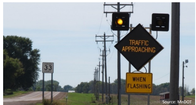
Activated intersection conflict warning system in Carver County, Minn.

Also addressing rural intersections, the Minnesota Department of Transportation investigated the effects of Intersection Collision Warning Systems (ICWS) at five unsignalized intersections throughout Minnesota. Using video collected at both treatment and control intersections all conflicts and near-crashes were identified. The number of near-crashes observed decreased by 26 percent overall at the five treatment sites while increasing at the untreated control sites (2017-01204) .