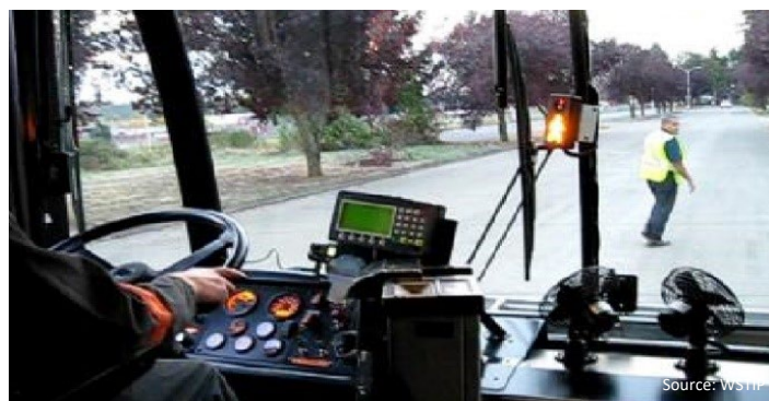
Center indicator illuminates as pedestrian crosses in front of moving bus.

Gaining driver acceptance of new technologies and seeking their participation in testing new products, though necessary, can be a challenge. A 2016 demonstration conducted under the auspices of the Washington State Transit Insurance Pool (WSTIP) involved field testing and evaluating a vision-based Collision Avoidance Warning System (CAWS) that uses cameras to provide coverage of blind zones where vulnerable road users may be hidden from transit drivers' view. Alerts and warnings about imminent collisions are displayed to the driver by visual indicators located on the windshield and front pillars.