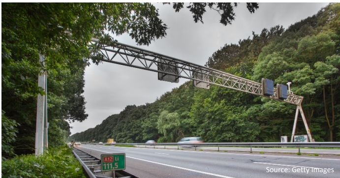
ATM-Advanced Traffic Management and Messaging System

Some selected benefits are shown in Table 1.