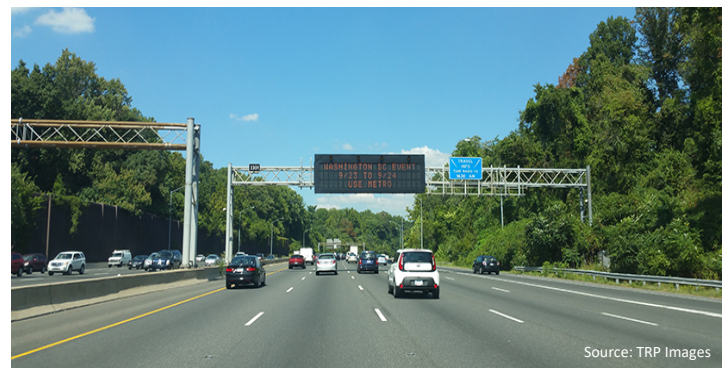
VDOT ATM Systems I-66 and 495 in Northern Virginia

Since the ATM system was activated in September 2015, an evaluation report released in October 2018 covered its performance from October 2015 through November 2017 for the operational analysis and from October 2015 through December 2016 for the safety analysis. Segment-level analysis was performed to determine the segments that had benefitted the most from the implementation of the ATM system.