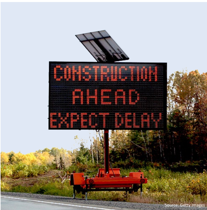
ATM-Advanced Traffic Management-Portable DMS Messaging Systems

Utah Department of Transportation (UDOT) implemented dynamic management of portable variable speed limit (PVSL) technology to reduce regulatory speed limits in active work zone control areas. This PVSL system used a dynamic VSL algorithm to raise and lower regulatory speed limits. The PVSL system also provided a queue warning algorithm that operated independent of the VSL algorithm to control roadside messages posted on portable dynamic message sign trailers.