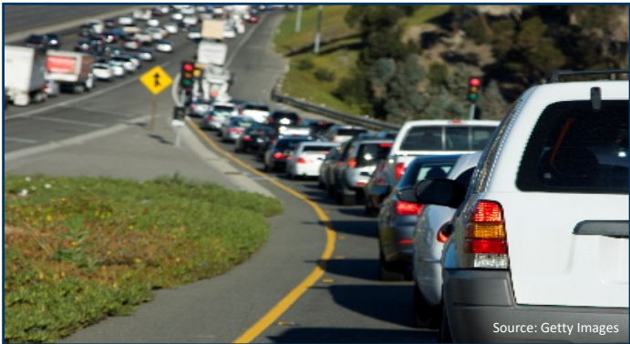
ATM-Advanced Traffic Management-Ramp Metering

Selected results from ramp metering deployments are listed in Table 2.