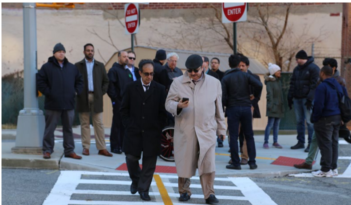
Figure 2: NYC's mobile pedestrian application being tested at the confined Safety City lot in Manhattan.

The New York City Department of Transportation (NYCDOT) led the New York City Pilot, which aimed to improve the safety of travelers and pedestrians in the city through the deployment of V2V and V2I connected vehicle technologies. NYCDOT's deployment provided an ideal opportunity to evaluate connected vehicle technology and applications in tightly spaced intersections typical in a dense urban transportation system. The NYCDOT CV Pilot Deployment project area encompassed three distinct zones in the boroughs of Manhattan and Brooklyn. Approximately 3,000 City fleet vehicles that frequent these areas were outfitted with the CV technology, along with 12 Metropolitan Transit Authority (MTA) buses. As a city bustling with pedestrians, the pilot also focused on reducing vehicle-pedestrian conflicts through in-vehicle pedestrian warnings. An additional V2I/I2V project component equipped approximately 25 visually