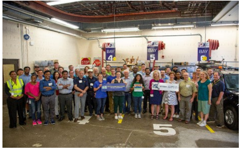
Figure 5: Group shot of the Interoperability Test participants pictured with the logos of the three CV Pilot sites: New York City (left), Tampa (middle) and Wyoming (right).

The systems' capabilities were demonstrated in staged scenarios on TFHRC's closed road course. In total, 102 interoperability test runs were conducted for four test cases – FCW, Intersection Movement Assist (IMA), Emergency Electronic Brake Lights (EEBL) and reception of Signal Phase and Timing (SPaT)/MAP messages. Data was downloaded off of the OBUs immediately following each test run, with nearly 5 GB worth of data being generated over the test period. This data was uploaded to the USDOT's Secure Data Commons (SDC) for further analysis to help identify lessons learned for future testing. Overall, the three-day testing event was a major success that went above and beyond the event's original testing objectives, with time allotted on the last day for some impromptu tests by the sites. Results of the testing indicated successful transfer of messages between the six vehicles fit with devices from five different OBU vendors. Out of the five vendors, four utilized DSRC and one used both DSRC and SiriusXM Radio. Additionally, equipment from New York City and Tampa's vendors demonstrated the successful transfer of messages between the site-configured RSUs and the sites' OBUs. The event was lauded by many for being well-planned, well-organized, and well-executed, with some attendees reporting that it was the most successful connected vehicle testing event they had ever participated in.