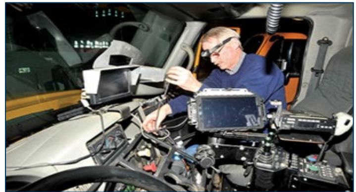
Figure 1: A member of the WYDOT installation crew installs the onboard units (Source: WYDOT).

The Wyoming Department of Transportation (WYDOT) CV Pilot focused on the efficient and safe movement of freight through the I-80 east-west corridor, a critical corridor for commercial heavy-duty vehicles moving across the northern portion of our country. The pilot aimed to address the needs of commercial vehicle operators in the State of Wyoming and developed applications that use vehicle to infrastructure (V2I) and vehicle to vehicle (V2V) connectivity to support a flexible range of advisory services including roadside alerts, parking notifications and dynamic travel guidance. This WYDOT CV Pilot sought to reduce the number of blow-over incidents and adverse weather-related incidents (including secondary incidents) in the corridor to improve safety and reduce incident-related delays. WYDOT developed systems that supported the use of CV Technology along the 402 miles of I-80 in Wyoming. WYDOT equipped approximately 325 vehicles, a combination of fleet vehicles and commercial trucks, with on-board units (OBUs). The 325 equipped vehicles included nearly 170 heavy trucks that were regular users of I-80 and over 150 WYDOT fleet vehicles, snowplows and highway patrol vehicles.