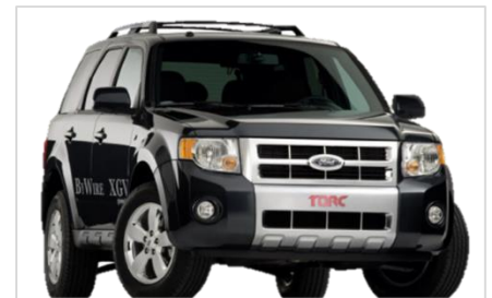
Figure 3: Vehicle Used for Testing at TFHRC

In 2012, the Applications for the Environment: Real-Time Information Synthesis (AERIS) team conducted a field experiment at TFHRC for the Eco-Approach and Departure at Signalized Intersections application. Successful experimentation showed up to 18% reductions in fuel consumption and carbon dioxide (CO 2 ) emissions for a single vehicle at a single fixed timed intersection. Drivers were provided with speed recommendations using a driver-vehicle interface (DVI) incorporated into the speedometer. Recommendation speeds were calculated based on the vehicle's location and signal phase and timing (SPaT) messages collected from the traffic signal. While the results were promising, the experiment identified potential driver distraction issues. As such, in 2014 the AERIS team undertook the GlidePath prototype application project—a first of its kind prototype—which incorporated automated longitudinal control capabilities along with the eco-approach and departure algorithm.