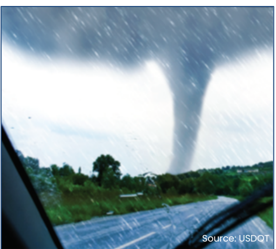
Road weather management systems enhance traveler safety in harsh weather conditions.