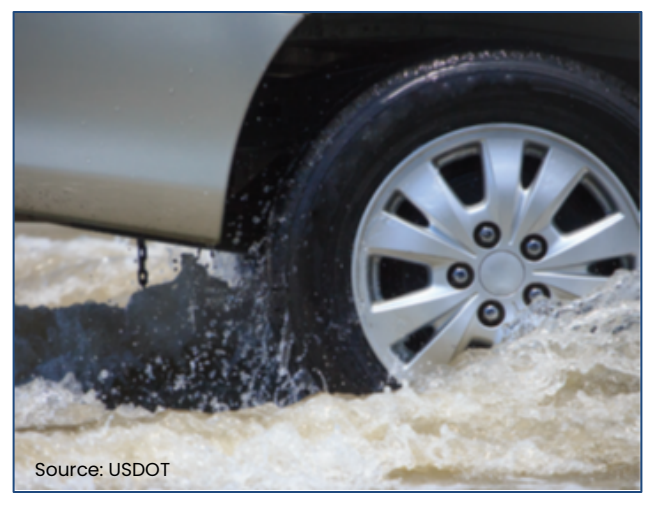
TMC's warn travelers of floods.