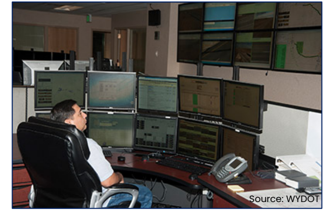
An operator in WYDOT's TMC monitors highways by watching several screens displaying road and weather condition information.

Software components that were incorporated into this project were the ITS Joint Program Office's (JPO) Operational Data Environment (ODE) and the National Center for Atmospheric Research's Pikalert<sup>®</sup>. The ODE ingests and processes connected vehicle