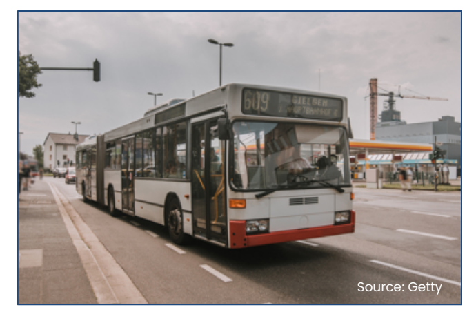
A bus system in a small urban area.

Almost all categories earned at least 50 percent overall positive benefit ratings; the exceptions were reduced travel times, at 48 percent overall positive, and cost savings, at 41 percent overall positive. The most prominent of the benefits was improved record-keeping, reporting, and data analysis, which was recorded as being greatly realized by just over half of responding agencies, and slightly realized by an additional quarter. No other category of benefits received nearly as high a "great benefit" rating.