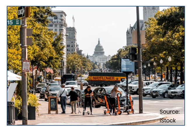
Micromobility in Washington D.C.

The D.C. Department of Transportation (DDOT) collected data from all these operators and carefully studied these data to understand how these dockless services operated in D.C. DDOT also surveyed citizens about the pilot to understand the public's reaction to the program. The pilot ended in August 2018 and DDOT released the phase 1 evaluation in December 2018.