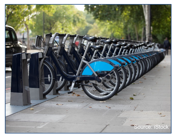
Dock-based bike share station.

However, increased bike and e-scooter travel may endanger pedestrians and riders if public authorities do not implement basic safety measures. Several studies recommend that municipalities strongly encourage helmet wearing and lower speed riding when operating shared bikes and e-scooters (2019-00901, 2020-00930).